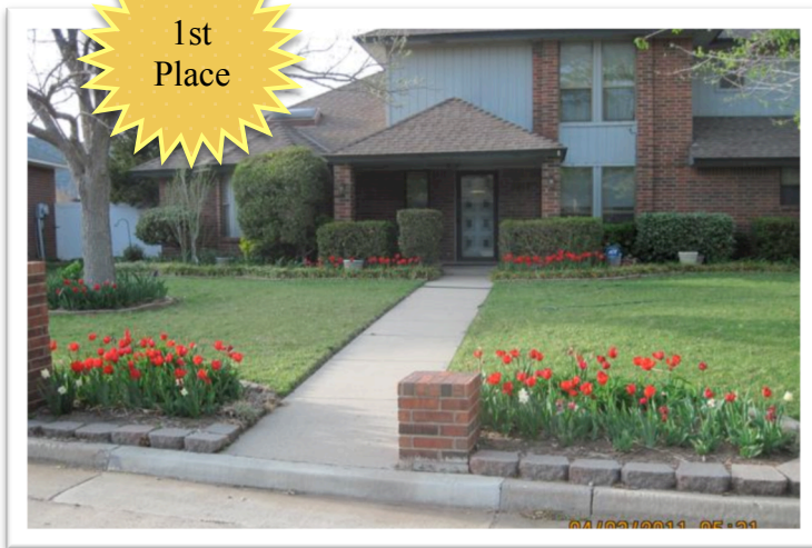
Norm & Victoria Tindall 7017 Basswood Canyon